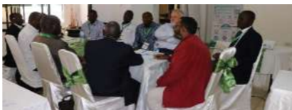
Group 1: Vice Chancellors and Deputy Vice Chancellors discussion on harmonization of curricula or possibilities of credit transfers/prospects for credit seeking in future