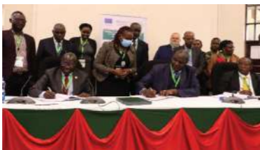
Signing of the Consortium agreement and Project launch, Moi University, Kenya in May 2024.