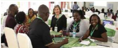
Group 4: Learning from previous mobility projects. The do's and don'ts