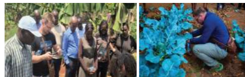
Consortium partners visit Sokoine University of Agriculture (Tanzania)'s partner site where the project trainees will be hosted.