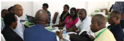
Group 2: How to enhance visibility and sustainability of the project in future