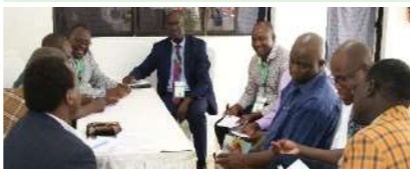
Group 3: Adhering to quality assurance in mobility